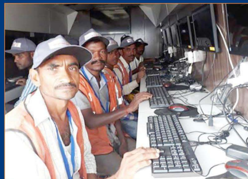
WORKERS LEARNING COMPUTER SKILLS