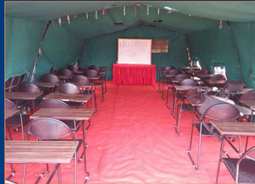
MOBILE THEORY CLASSROOMS