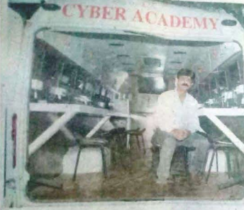
किस हो यदि आपको कल सीखना हो और ट्रेनिंग खास बात है कि ये लेबर क्लास को निःशुल्क