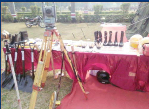
CONSTRUCTION TRAINING EQUIPMENTS