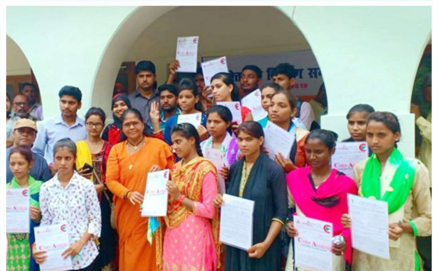
Job Offer Letter distribution by Rural Development Minister Sadhvi Niranjana Jyoti Ji for Vardhman Textile India Ltd. (20th July, 2019, Fatehpur Centre, U.P.)