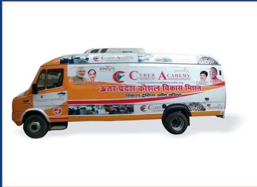
MOBILE COMPUTER LAB